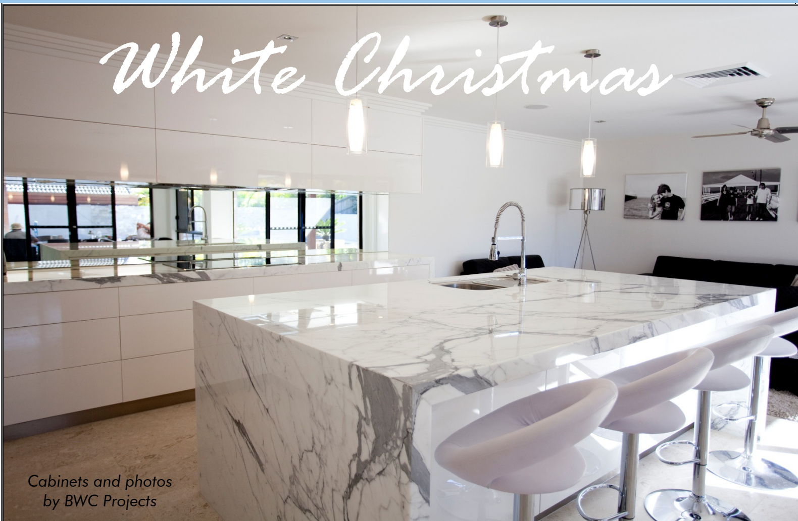
Cabinets and photos by BWC Projects

It's not often we have the opportunity to work on such a daring and beautiful kitchen design but when we do you can be sure we will put our all into it.